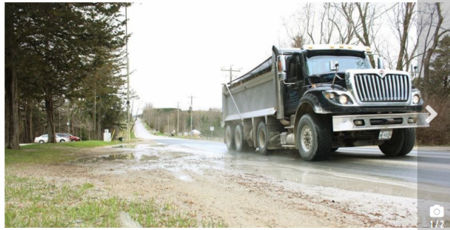
A gravel truck travels east on County Road 91 through Duntroon.

Is it safe for a fully-loaded gravel truck to make the 200-metre descent into Duntroon?